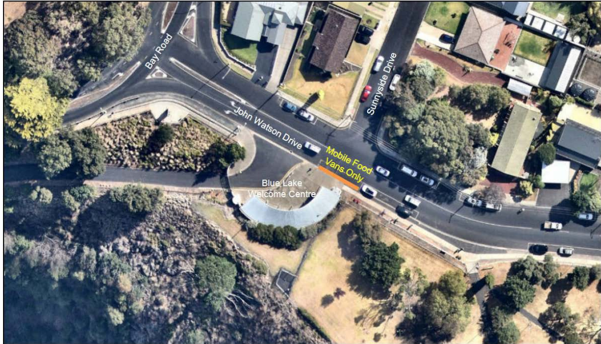
Mobile Food Vans Only - John Watson Drive - Blue Lake Welcome Centre