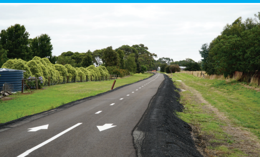
Our City. Our Response COVID-19 initiatives