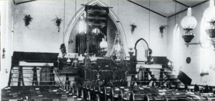
• Above: Bay Road, 1955. Below: Methodist Church, 1890.

We acknowledge and thank everyone involved in the previous City of Mount Gambier Heritage Committee for the work and research they put in to the historic information enclosed in this brochure. More information about these and many other historic buildings around the city can be found on the Mount Gambier Library website www.mountgambier.sa.gov.au/ library and at the Mount Gambier Visitor Centre.