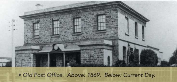
• Old Post Office. Above: 1869. Below: Current Day.