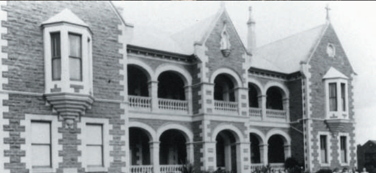
• Convent of Mercy. Above: 1918. Below: Current Day.