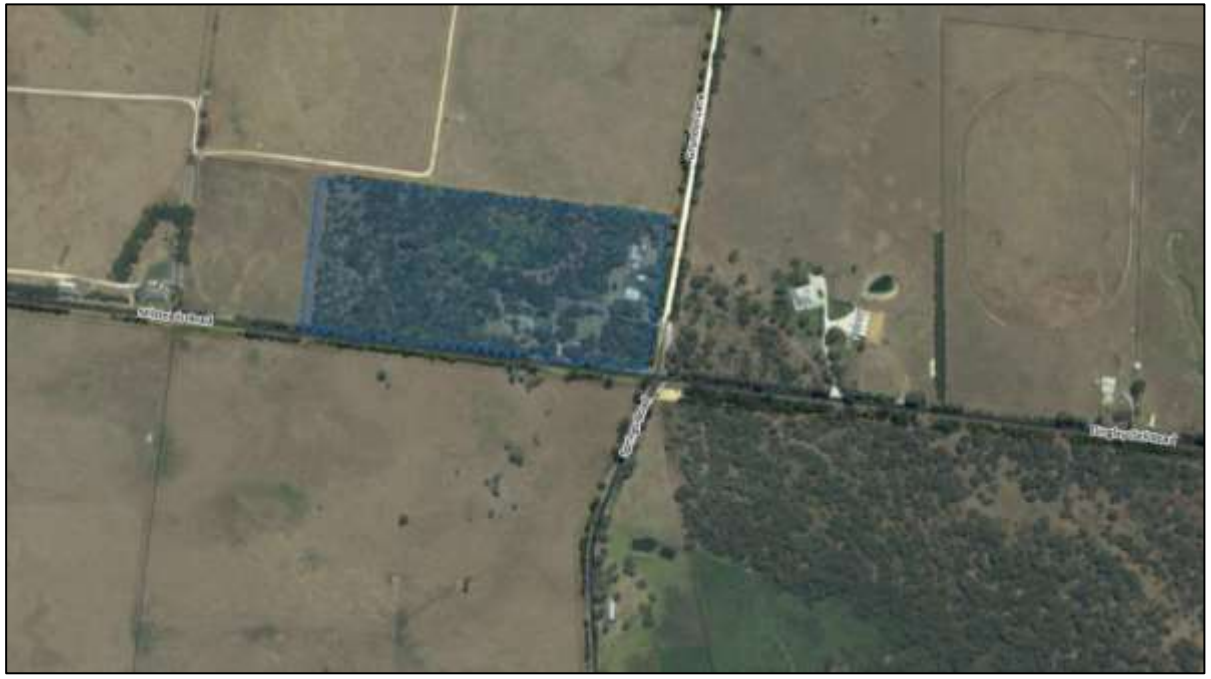
Figure 1: Subject land

Photographs of the subject land are included within the attachments.