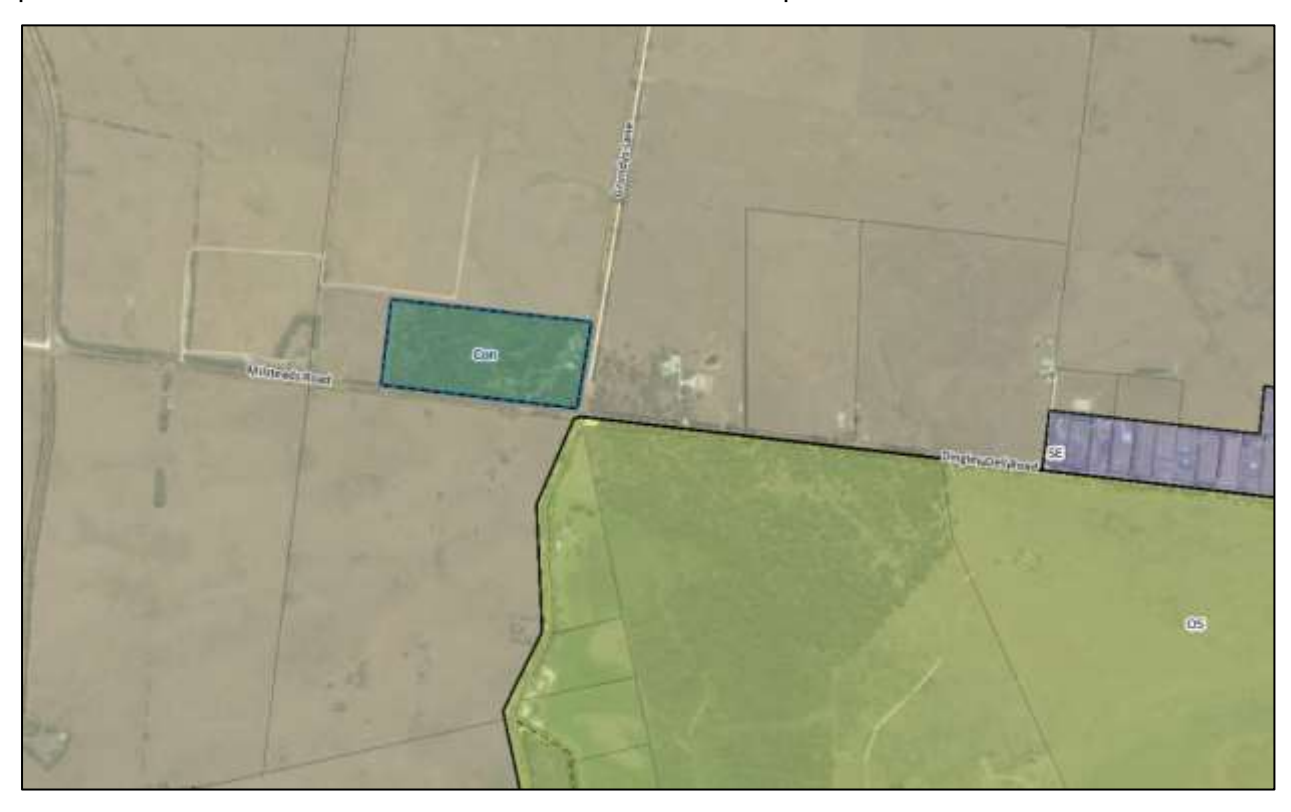
Figure 3: Subject land and zoning

The subject land is located within the Conservation Zone, with the neighbouring rural properties located with the Rural Zone and the adjacent Flora and Fauna Reserve and land to the south east within the Open Space Zone as showing within Figure 3 below. The assessment of the proposal has been limited to the provisions of the Conservation Zone along with the relevant overlays and general policies as outlined within the attached extract of the Code provisions.